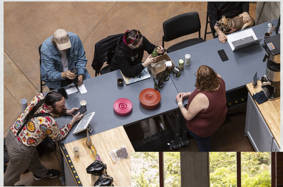
Student life at the University of Oregon: Willamette Hall (top and center), EMU (Erb Memorial Union, bottom)

Back: Columbia Hall (bottom), EMU (center), Hayward Field (top left)