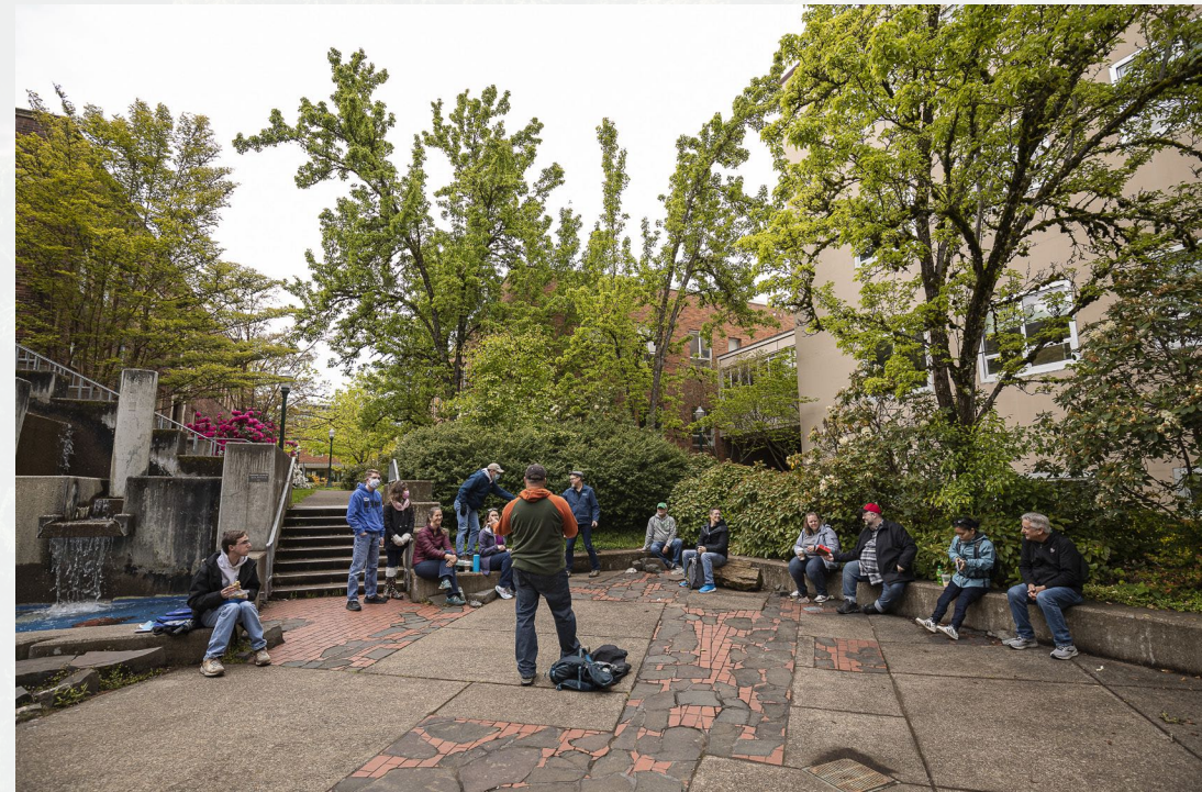
Outside of Cascade Hall at the University of Oregon

Each year, we share the same table. It shows the major categories (Generally Accepted Accounting Principles, or GAAP) we are encouraged to report on by the independent accounting firm performing our financial review. But what do these numbers actually represent? In this year's annual report, we'd like to touch on these categories and make these numbers a little more concrete in terms of ministry.